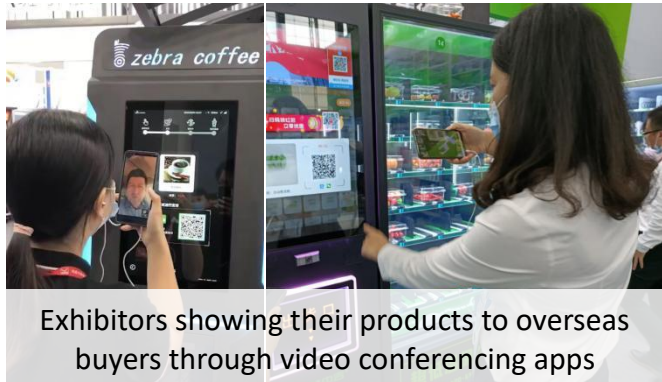
Exhibitors showing their products to overseas buyers through video conferencing apps

Attracting buyers from Germany, Jordan, Ecuador, Malaysia, Ethiopia, Russia, Singapore, Australia, India, Indonesia, France, Romania, and etc. , our First-Ever Online Matchmaking Program , set to connect global buyers and suppliers amid the ongoing pandemic, has witnessed plenty cross-border cooperation reached during the show.